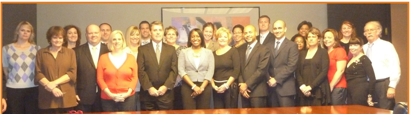
Ford & Harrison Tampa Office

As noted above, recognition is given to the entire Tampa team for their activities in local organizations and charitable endeavors. That involvement includes, among other things: monthly monetary "Random Acts of Kindness" contributions to such worthwhile organizations as Kids Charity of Tampa Bay, Inc., ( www.kidscharitytb.org ), Florida Coalition Against Human Trafficking ( www.stophumantrafficking.org ), Metropolitan Ministries ( www.metromin.org ), Make-A-Wish Foundation® of Central and Northern Florida ( http://wishcentralfl.wish.org ), Salvation Army's Trinity Café ( www.trinitycafe.org ), Meals on Wheels ( www.mealcall.org ), Wheels of Success ( www.wheelsofsuccess.org ) and the Marine Toys for Tots Foundation ( www.toysfortots.org ). The office has also donated needed supplies to "Help Us Fill the Wagon" School Supply Drive for Foster Children, food for Metropolitan Ministries and so far we've sent 12 large boxes of supplies and goodies to our Afghanistan troops.